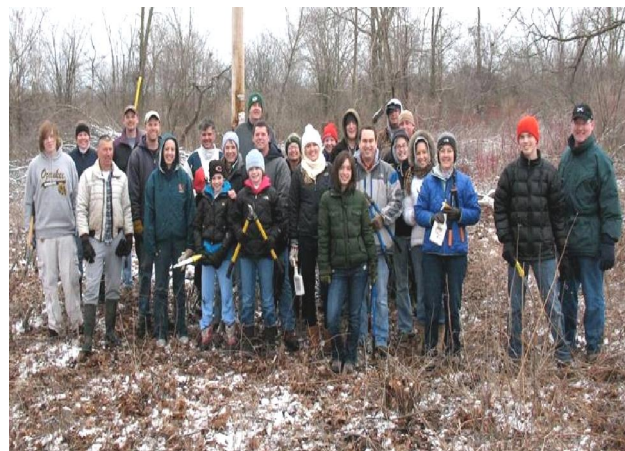
Disney Day Volunteers at Mequon Nature Preserve